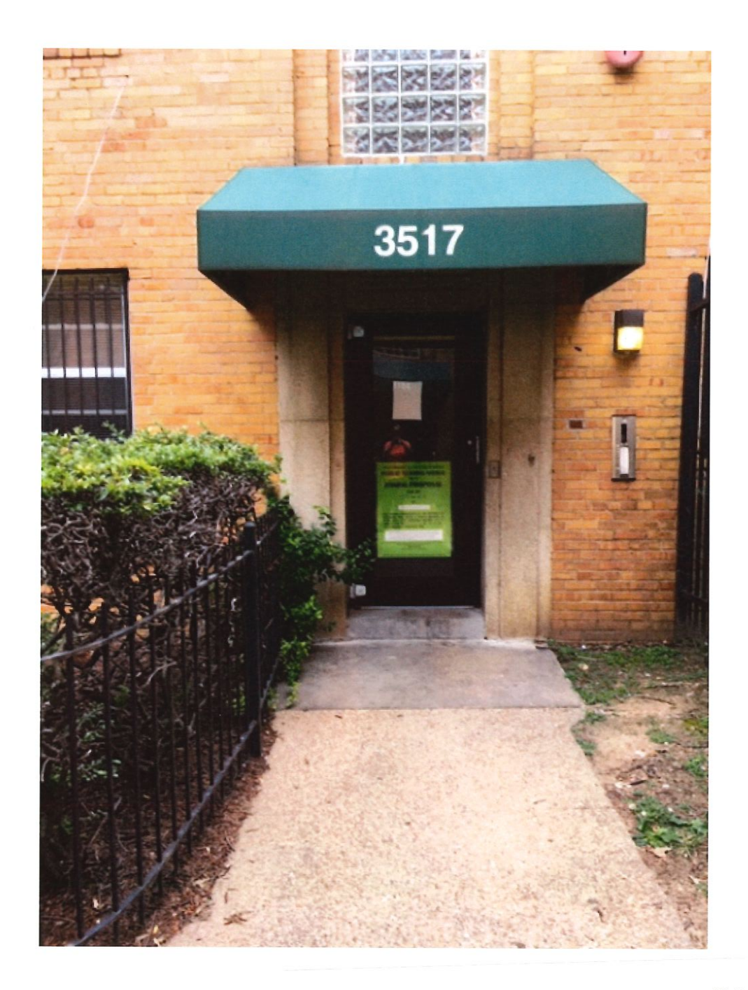
Notice 23: Taped to the front door of the building at 3517 A St., S.E., Washington, D.C.