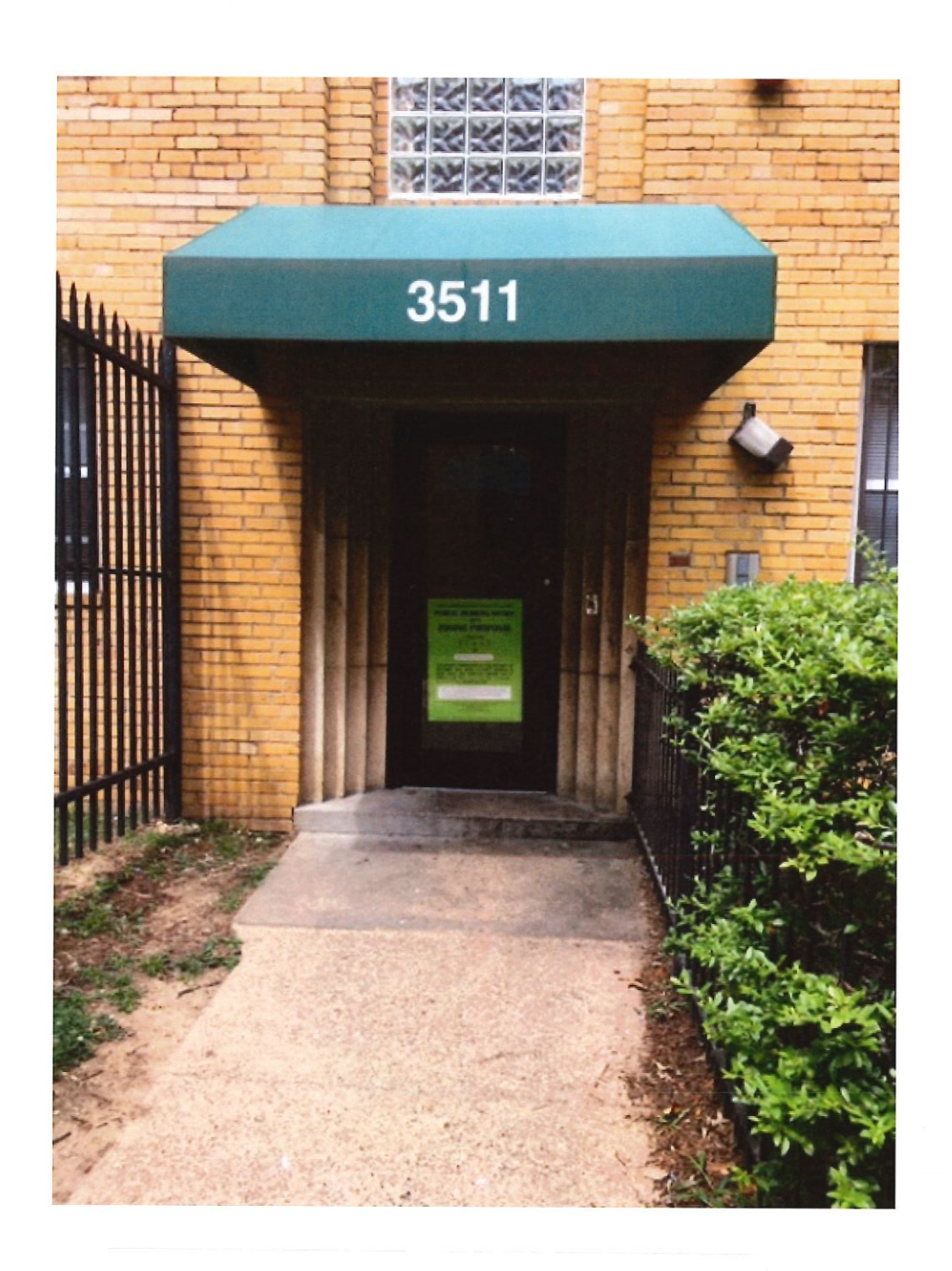
Notice 24: Taped to the front door of the building at 3511 A St., S.E., Washington, D.C.