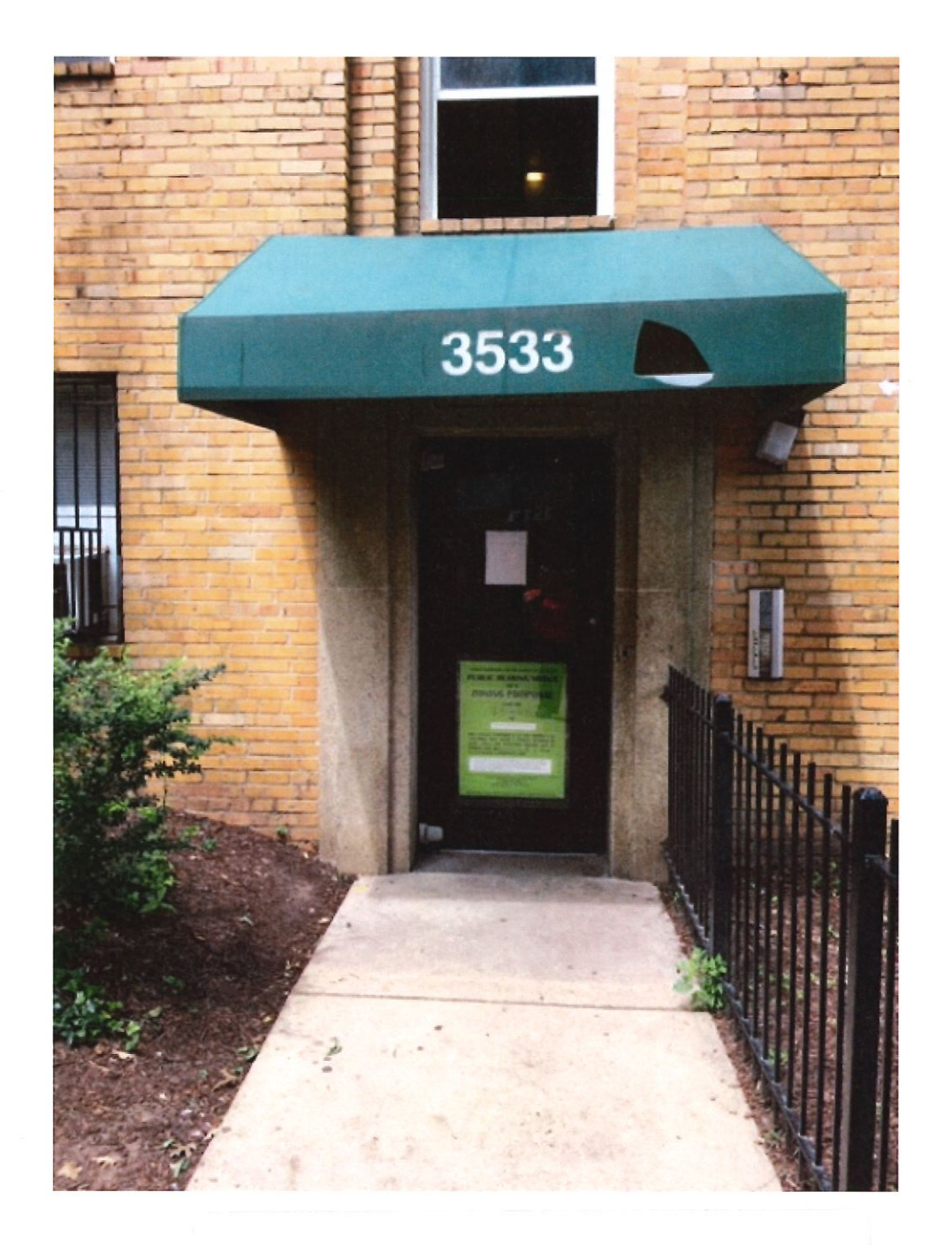
Notice 21: Taped to the front door of the building at 3533 A St., S.E., Washington, D.C